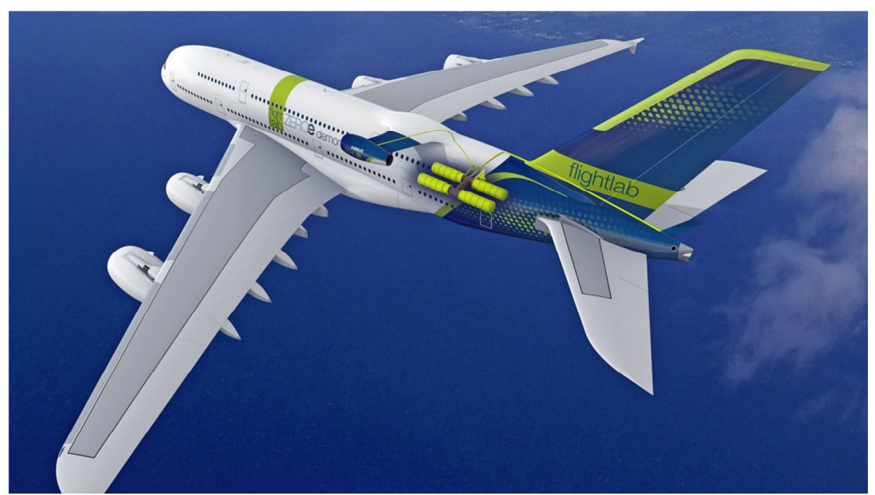
3. A laboratory aircraft based on a modified Airbus A380 will be used for testing future hydrogen propulsion systems for commercial aviation (illustration: Airbus).

In November 2022, Airbus announced plans to develop hydrogen-electric propulsion systems powered by fuel cells for use in commercial aircraft. As part of the ZEROe program, Airbus aims to test this propulsion system on a flying laboratory built from an Airbus A380, the largest commercial aircraft ever built. Test flights for the new engine are scheduled for 2026, with the goal of deploying a hydrogen-powered aircraft by 2035.