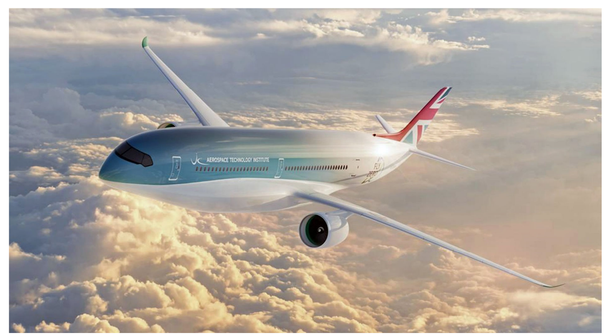
4. One of the hydrogen aircraft concepts developed by the UK's Aerospace Technology Institute (illustration: ATI).

Airbus and ATI's initiatives illustrate the global shift towards hydrogen-powered aviation, leveraging cutting-edge technology to address sustainability challenges. Airbus' ZEROe program focuses on modular, scalable hydrogen propulsion systems, while FlyZero explores a wide range of aircraft configurations. Together, these programs underscore the industry's commitment to decarbonizing air travel and redefining the future of aviation.