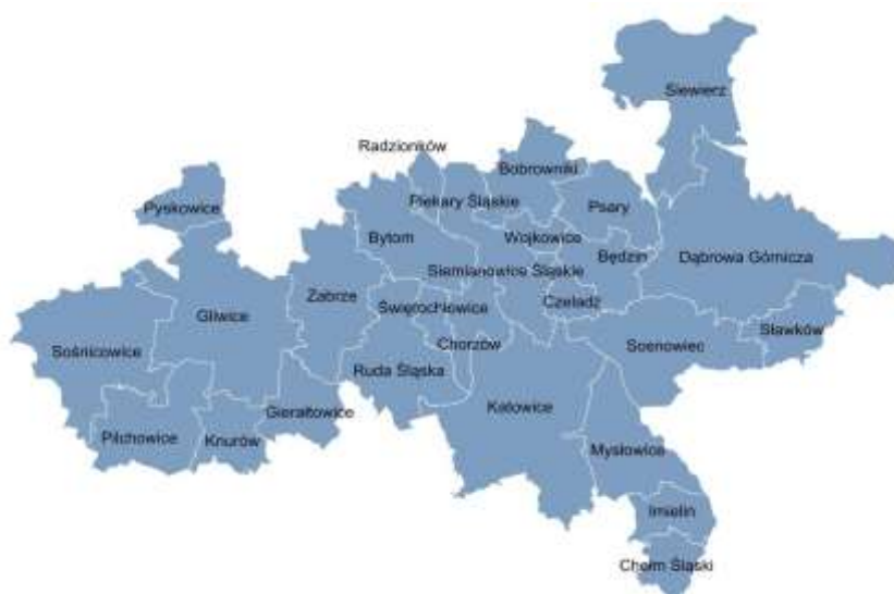
2. The territorial scope of KZK GOP, Source:Projekt Planu Transportowego Województwa Śląskiego, 2015 r.

KZK GOP organizes public transport in the municipalities belonging to him together with the neighboring towns that do not belong to the association. The territorial scope of entities affiliated to the relationship shown in the figure below.