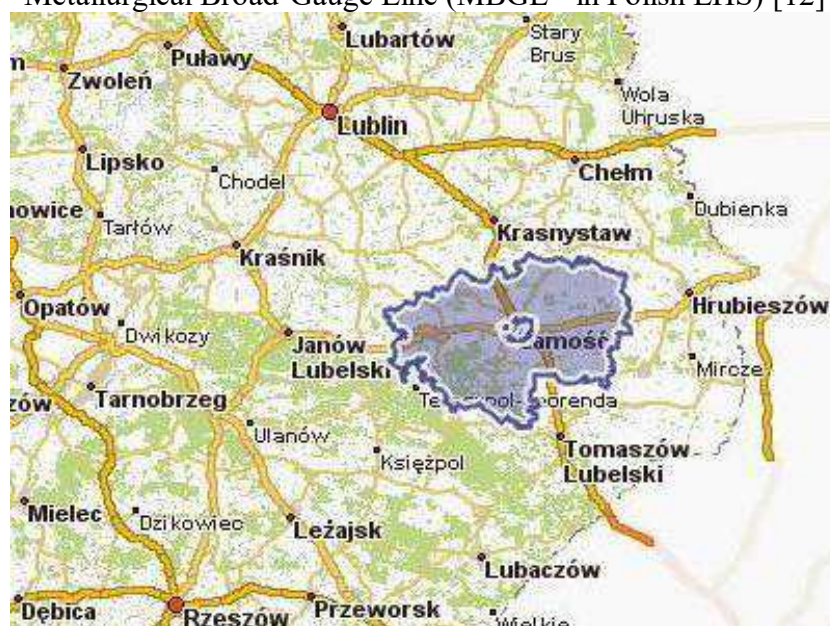
1. Zamość district [14]

Zamość district is located in the southern part of Lublin Voivodeship (Fig. 1) and covers 15 gminas (including 3 urban gminas) with the area of 872.27 km 2 . It includes such geographical areas and the Lublin Upland (Zamojski Padół, Dział Grabowiecki, Zachodniowołyńska Upland (Grzędy Sokalskie) and Roztocze (Western and Central). Through the Zamość district, dangerous goods are transported by road and rail. Road Transport of hazardous goods is based on the provisions of the ADR, while the rail transport under the provisions of the SMGS and RID. Each class of cargos is characterized by individual properties and the structure of a substance. This district has two routes, which enable the transportation of dangerous goods. The first route is the national road No. 17 Hrebenne-Lublin and the rail road – Metallurgical Broad-Gauge Line (MBGL - in Polish LHS) [12] (fig.1).