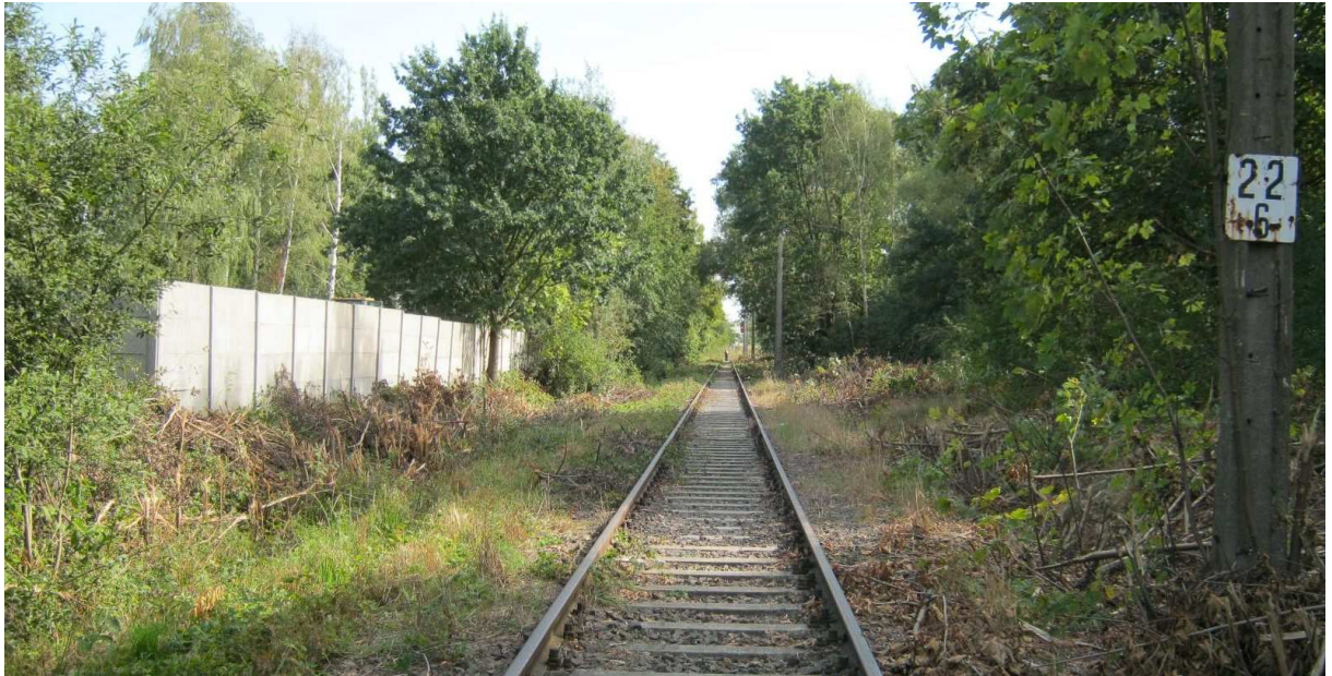
1. Railway line No. 292 on the section between the stations Wr. Sołtysowice and Wr. Osobowice

under the railway track (there is a traffic light system installed there), and there are as many as 6 bus routes (A, 105, 116, 118, 130, 305). At the beginning of 2015, PKP PLK announced that it would modernize the Wrocław - Oleśnica railway line, under which the viaduct over Boy-Żeleński Street. Thus, there was the possibility of not only removing the said "bottleneck" but also to obtain something more, namely to build a new overpass in such a way that the tram line could also be underneath.