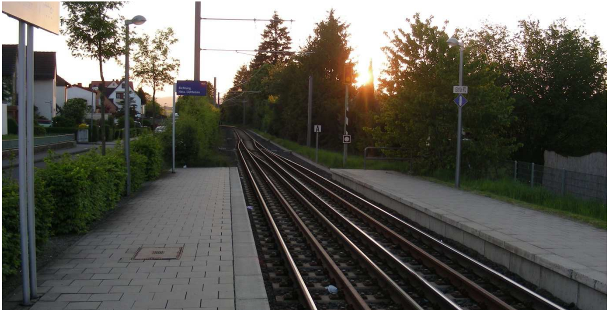
2. Weave track at the Niederkaufungen Mitte stop on the tram route line 4 from Kassel to Hessisch Lichtenau

end of the route. The route 4 tramways was extended in a similar way: in 1998 to Kaufungen Papierfabrik, in 2001 - to Helsa, and in 2006 - to Hessisch Lichtenau, using for this purpose a single-track railway line to Waldkapel, running since 1985 exclusively freight traffic. It was also here that electrification by tram voltage, adjusting the geometry of the crosstalk, built was passed, strands (pic.2) and loops, and in certain sections (in Kaufungen and Hessisch Lichtenau) completely new sections of tram lines were built, better penetrating built-up areas than the line used railway.