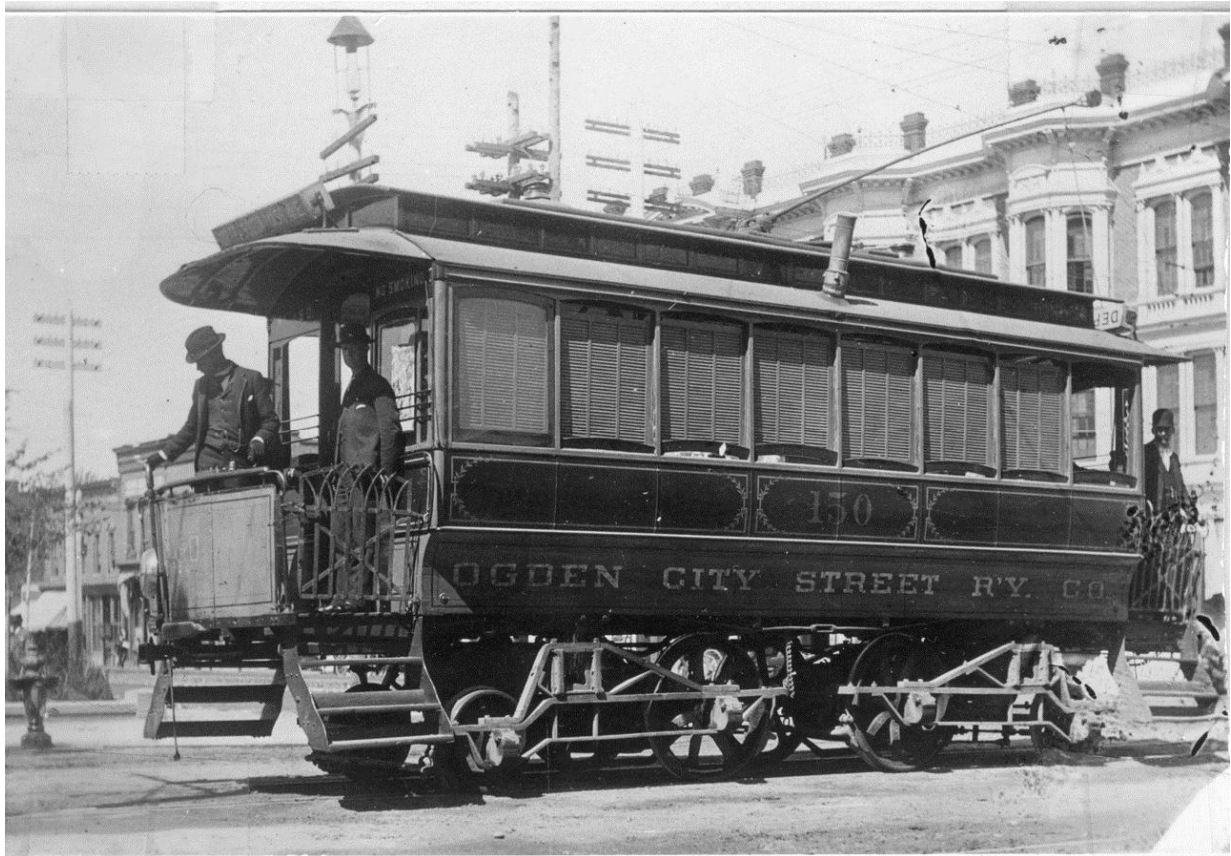
2. Electric tram with extremely high floor, approx. 1895 (public domain) [6]

This state of affairs was not particularly troublesome in the early years of tram systems, and for a long time in smaller towns. The relatively low intensity of traffic and the small capacity of the wagons did not cause any significant disturbances in maintaining the timetable. Real problems began in the last decade of the nineteenth century when in larger cities the tram traffic became so intense that it was necessary to take appropriate countermeasures. The tried-and-tested solutions included, among other things, the use of a trailer, lengthening of wagons (including the first attempts to build multi-compartment cars), increasing the speed of travel, extending inter-adjacency intervals. At the same time, it was noticed that significant losses of time are caused by the exchange of passengers at stops and the related system of selling tickets to people on board. In addition to transferring ticket sales to the interior of the car, two attempts were made to solve the problem: by building high platforms tailored to the vehicle floor, which was virtually impossible in the case of a classic streetcar in mixed traffic, and by lowering the floor in vehicles, which it became real already at the beginning of the 20th century with a reduction in the size of electric motors and the use of Maximum trolleys (Fig. 3).