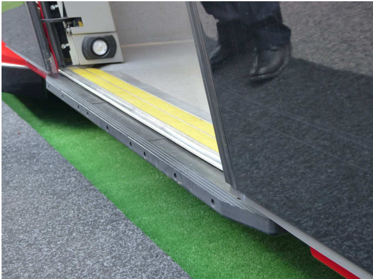
6. Skoda Forcity Plus streetcar doors equipped with a threshold

c) Platform with dimensions of 1285/320, modifications to the existing rolling stock. To reduce the horizontal gap to the value of approximately 45mm, the above-described thresholds should be installed. Despite a good height adjustment, the problem with the existing rolling stock is the lack of a floor height system - the margin for lowering the threshold due to deflection of the suspension together with the wear of the wheel rims is only 30mm, with the now reduced wheel radius due to 40mm rim wear, which will increase maintenance over a reasonable measure. It will also be necessary to check the value of the offset of the open sliding-sliding doors from the side of the car. Trams must be installed on all trams to achieve the effect described in b). The rolling stock came in half-width as in a) and the nominal height of 350mm (identical with the PESA and Skoda cars), with the floor height maintenance system in the 320-350mm range.