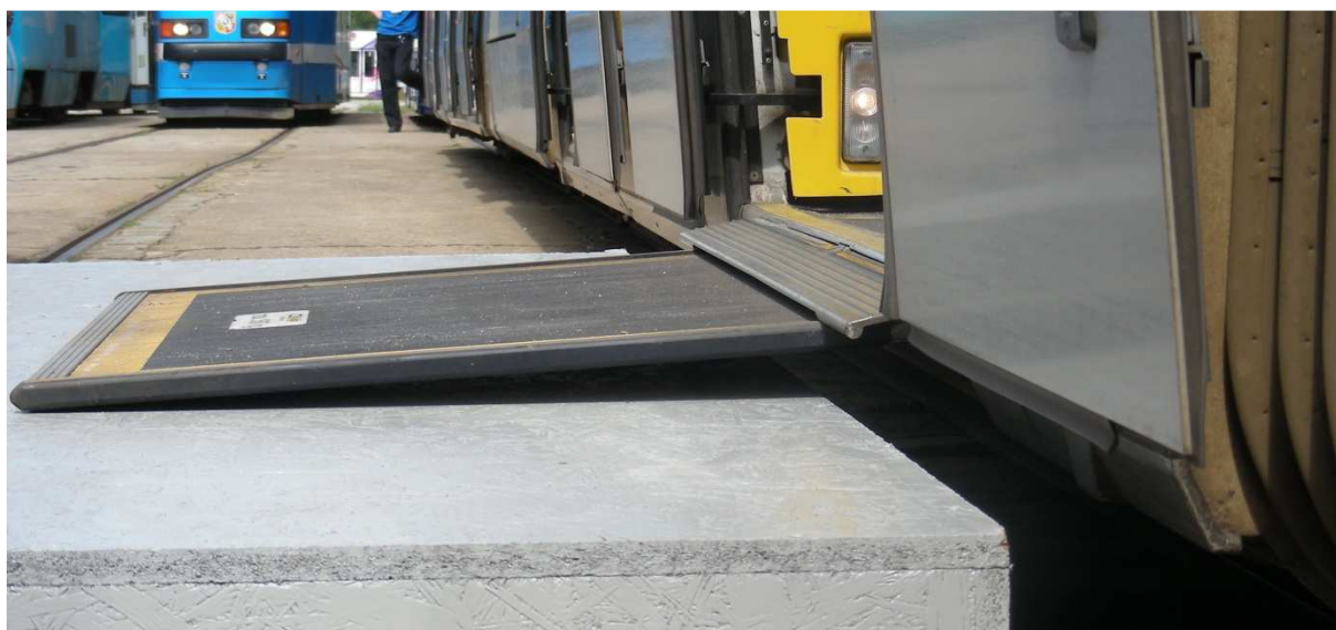
5. Skoda 19T with a spreading ramp near the platform 1285 / 270mm

a) Platform with dimensions of 1285/270, no modification in the existing rolling stock. The adoption of this solution means that the passenger exchange takes place in more favorable conditions than on any existing platform in Wrocław, but the service of disabled passengers without disassembly of the ramp is still not ensured (Figure 5). The future rolling stock should be better adapted to the platform by lowering the nominal entry edge to 300mm above pgs, using the floor height maintenance system in the 270-300mm range and mounting the thresholds reducing the horizontal gap to 45mm, while maintaining the box half-width of 1200mm.