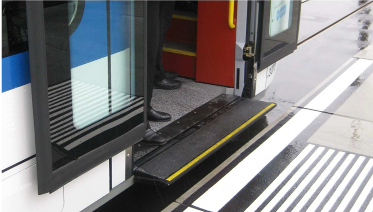
4. A door with a movable step used in Zurich, photo by Andrew Nash (fragment)

The problem of oblique positioning of the car box fragments in relation to the platform and the associated excessive horizontal gap is solved by locating where possible stops at straight sections of the track, even at the expense of changing their current location, and thus placing the door on the length of the vehicle so that it always falls on side of the car. In maintaining a small vertical gap, compensating for the effects of a wheel, rail or vehicle load, a large number of passengers are assisted by automatic floor height adjustment systems, already used even in domestic production trams [12]. As already indicated, these solutions are effective and easily applicable to new investments. The issue becomes much more complex when modernizing existing tram networks, especially those where different types of wagons have different width of the box in its lower part and different height of thresholds. The next part describes the proposal to solve this problem on the example of Wrocław trams.