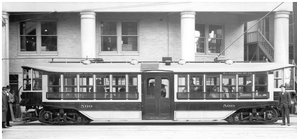
3. Low-floor tram from Brill, Vancouver, approx. 1910 [3]

In spite of the relatively dynamic development of such constructions, their shortcomings quickly emerged, which could not be removed with the then state of the art. These vehicles were not suitable for routes with significant longitudinal slopes, because they were practically unable to overcome the vertical curves of the track, while the centrally placed doors were relatively narrow and thus impeded the flow of passengers, or significantly weakened the structure of the car causing its deformation and cracking. Therefore, apart from the episode of the "Montos" carriage in the 1930s, low-floor constructions were again developed only at the end of the 1980s.