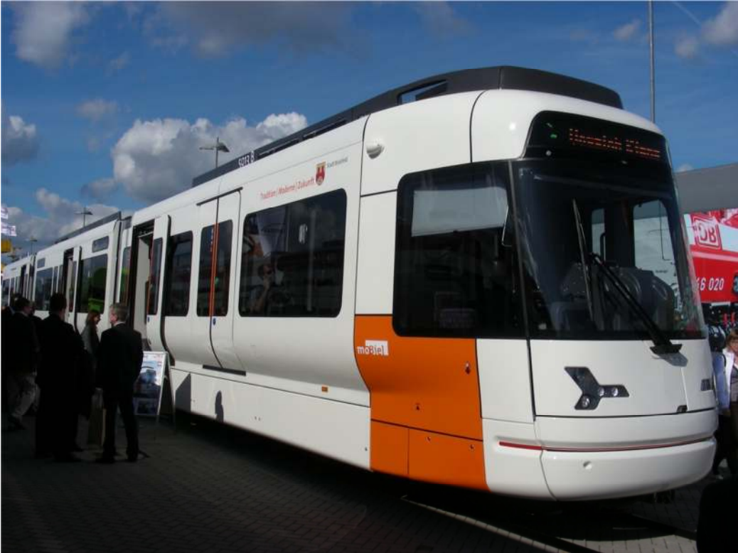
2. GTZ8-B Vamos city rail train for Bielefeld, total width 2.65 m, at platform height - 2.30 m, adapted to platforms 920 mm above the railhead level