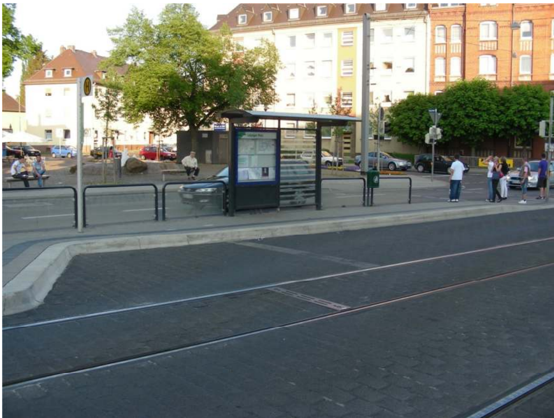
5. Kassel, Leipzigerplatz - example of adjacent, independent platform edges for a bus (in the center of the photo) and a tram (not visible, on the left)

Many stops within the network area are adapted to accept both trams and buses. The issue of the proper shaping of the platform edge and the selection of its height, discussed in the previous chapter, becomes more complicated. The analysis of European trends leads to the conclusion that two groups of solutions are used here. The first of them are platforms with a compromise height. Since they are most often built according to the bus standard, they turn out to be too low for convenient access to the tram by about 8-10 cm. Only recent Swiss proposals [1, 11, 12, 19] indicate that the problem is solved by an edge with a height of 28 cm above the railhead level. For a tram with a threshold height of 300mm, the difference is only 20mm, and buses at these stops are not to lower the suspension. Examples of structures built according to these guidelines are already in use, but for too short a time to speak of binding conclusions. The second group of solutions are platforms in which the stopping points of the tram and bus are separate, but connected by a ramp or the width of the platform into one whole, then the edge heights fit closely to the floor in the vehicle. An example of such a solution is shown in photo 5, where a short bus lane has been created within the tram stop.