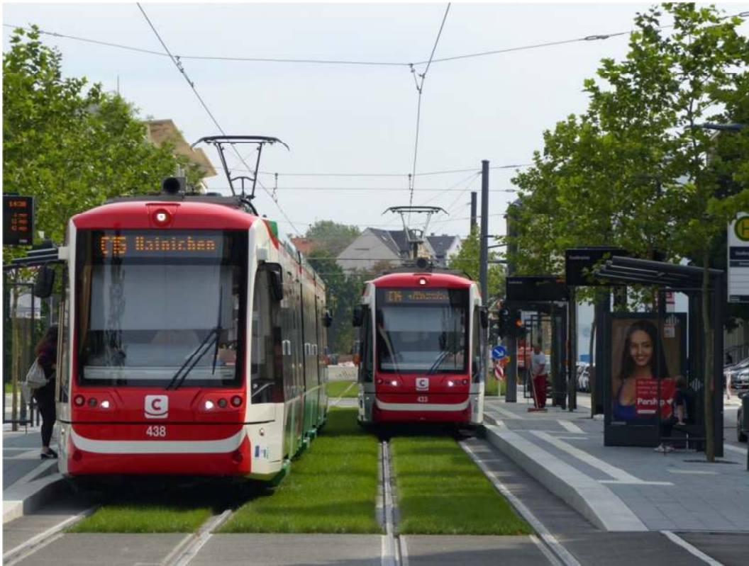
7. Stadler Citylink trams at the Stadlerplatz stop in Chemnitz. Visible use of two Variobord heights