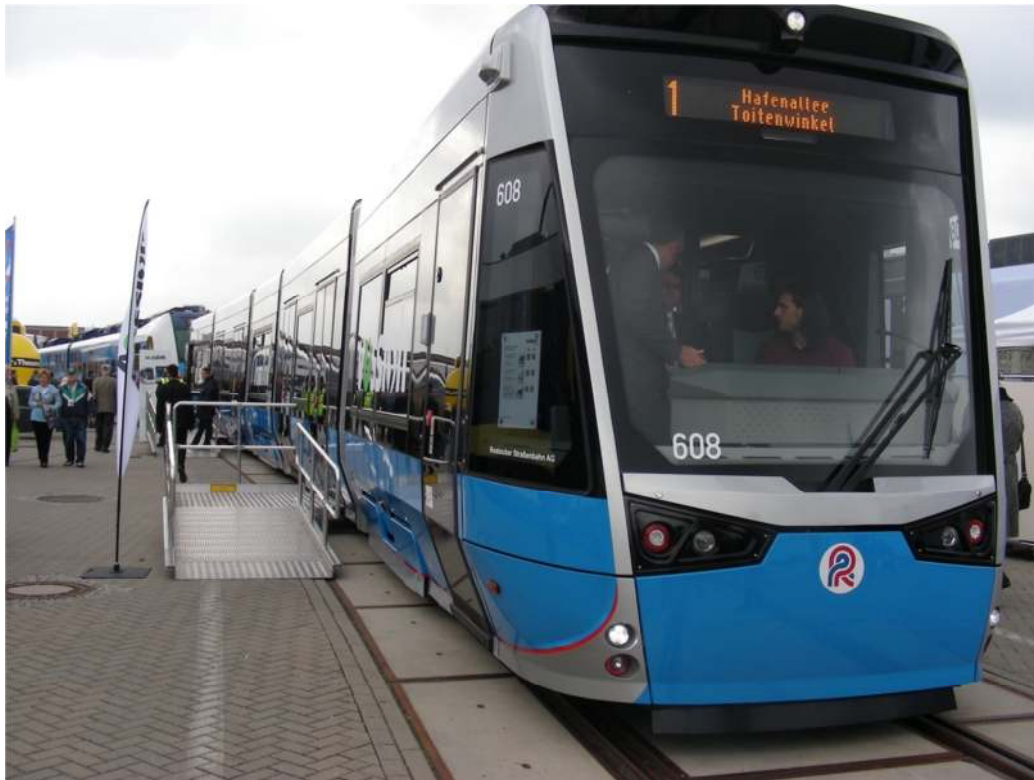
1. Vossloh Tralink 6N2 for Rostock, total width 2.65 m, at the platform height - 2.30 m, adapted to platforms 290 mm above the railhead level

narrower from the feet to the knees than from the pelvis to the shoulders. Following this outline for a seated silhouette, the wagon body retains its former width (e.g. 2.30 or 2.40 m) at the platform height, smoothly widening to around the line of the lower edge of the windows, while as many seats as possible at the sides of the wagon. Examples of vehicles constructed in this way are shown in Figures 1 - 3. Photo 1 shows the Vossloh 6N2 Tralink, delivered to Rostock since 2014, the width of which increases from 2.30 to 2.65 m, and which is adapted to work with low platforms because its threshold is 290 mm above the railhead level [20]. Similar trams are to be delivered to Dresden: the prototype is to appear on the tracks already in 2020, and the series vehicles - from 2023.