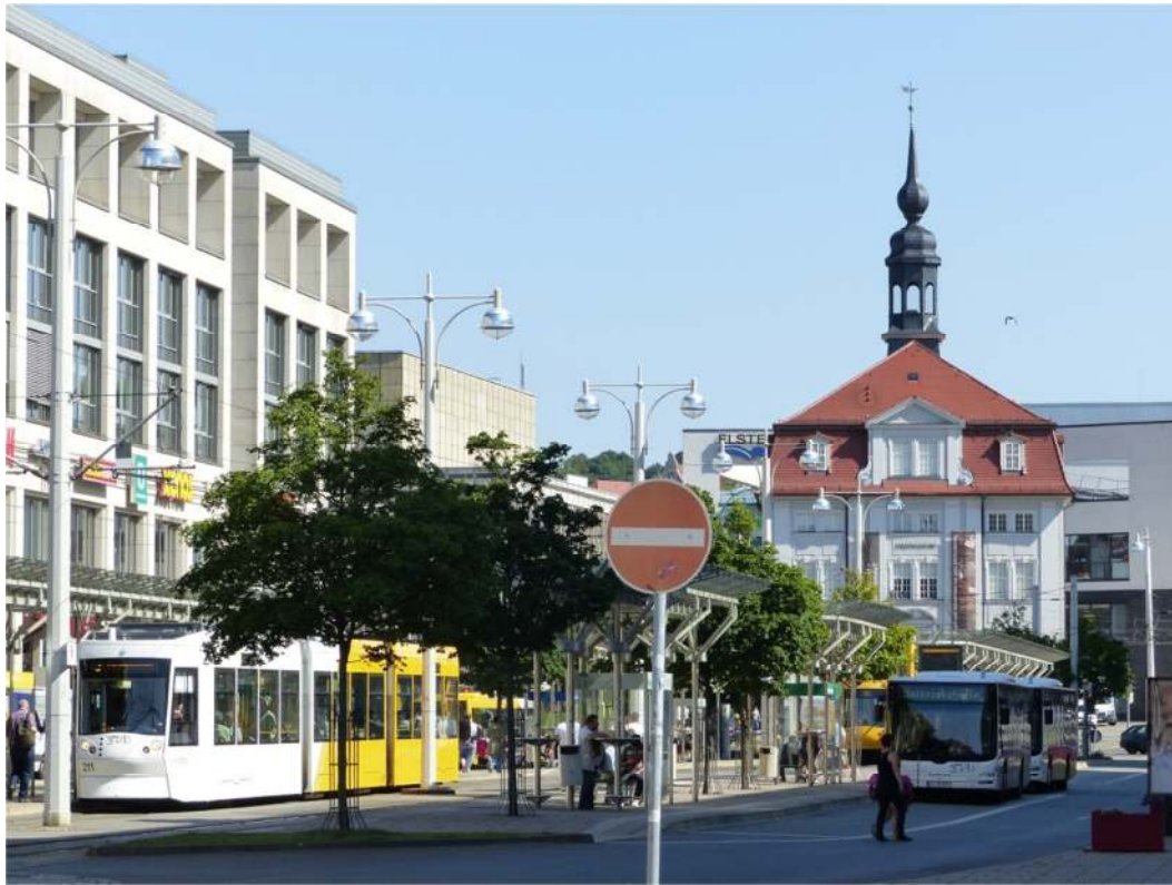
6. Gera, Heinrichstrasse - interchange junction with left-hand bus traffic, so that transfers between buses and trams take place across the width of the platform

and the roadway. An example of a set of two-edge platforms, constituting the central transfer junction in Gera, is shown in photo 6. A special feature of the node is the left-hand traffic of buses, excluding other road traffic, which may be confusing for people unfamiliar with the specificity of the system.