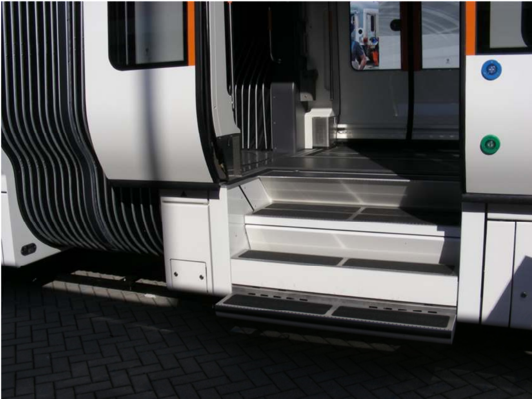
3. View of the unfolded steps of the wagon described in figure 2