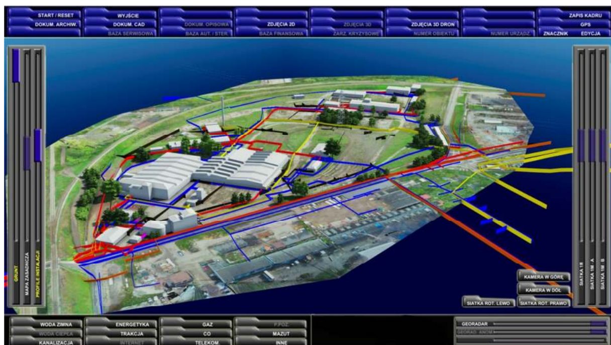
2. Screenshot of the investment area with rail infrastructure, with 3D visualization of VIRTUAL PROFILES of underground installations.

Such high precision and speed of data processing now enable the real-time generation of virtual images superimposed on real images in a "passive" and "interactive" form. "Passive" superimposition is a simple superimposition of a virtual image on a real image, and "interactive" superimposition is a combination of a real image with an interactive, or variable, virtual image, parameterized in real-time.