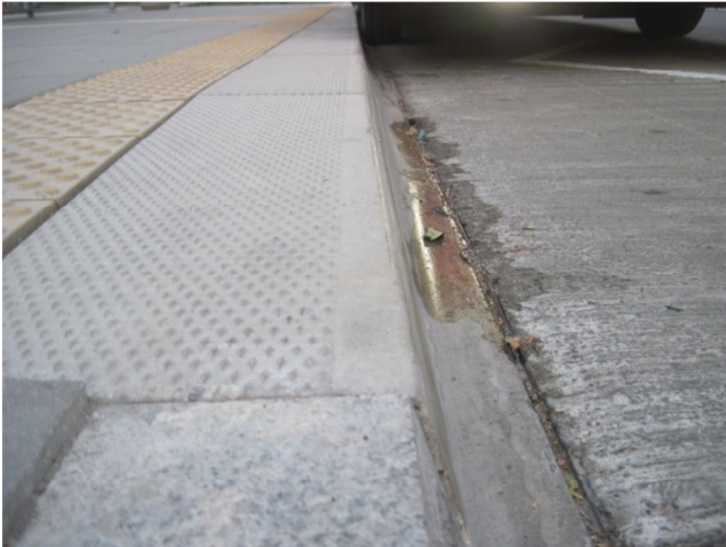
3. Platform curb with the lower part protruding towards the road and a rounded connection with the vertical part and a rounded upper edge, which makes it easier for the vehicle to drive up to the platform without deteriorating the technical condition of the vehicle and the curb

The effectiveness of this curb depends on the vehicle's approach angle - the contact between the curb and the wheel, which must be minimal. And this can only be ensured by correct slopes of the bay, or not making the bay at all (bus stop in the lane).