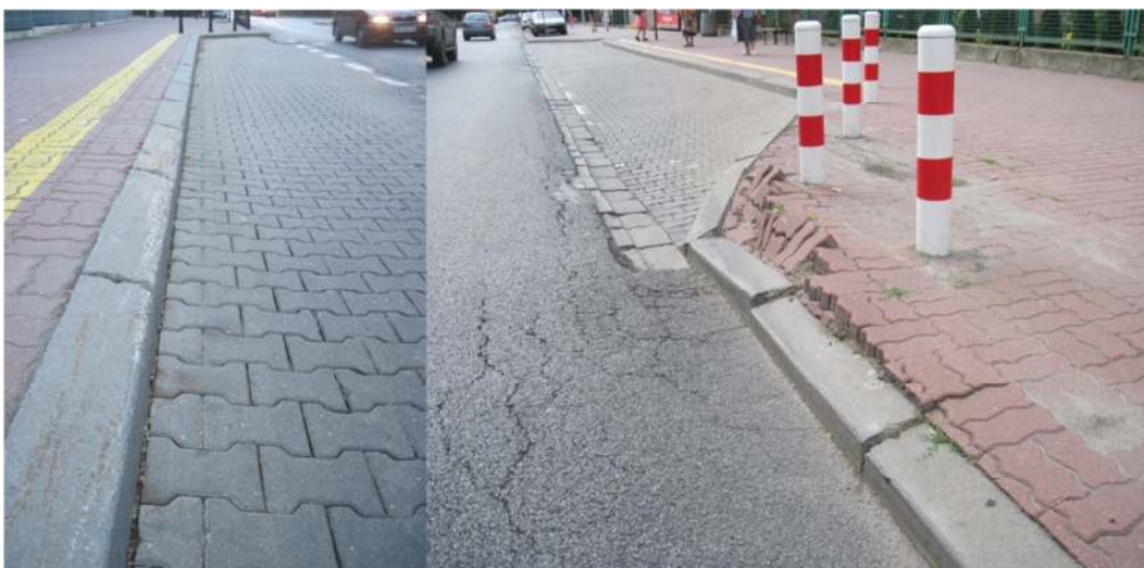
2. Damage to the bay and the stop platform caused by vehicle impacts - abrasions and chipping of the curb and destruction of a too "sharp" entry slope of the bay