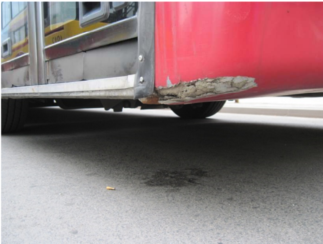
1. The damaged lower part of the bus chassis body from hitting the edges of the platforms

and exit, in accordance with [3] in the following proportions: 1: 8 (entry) and 1: 4 (exit) or "milder". Making "sharper" slants forces the drivers to make larger turns of the steering wheel (which drivers do not like), and also causes the bus body to protrude excessively beyond the wheel line. If the distance is incorrectly assessed, it may result in the wheels hitting the curb and cutting the tires. And in the case of excessive passenger load and uneven surface of the bay, lead to the body lump hitting the curb (Fig. 1). A vehicle hitting the curb is also not indifferent to the curb, they cause its chipping, bending as well as breaking off and deforming the surface of the platform and the bay (Fig. 2) [2].