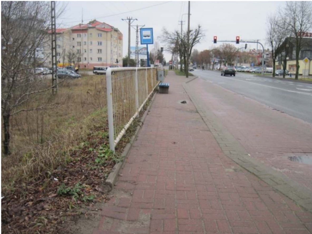
6. A stop platform with a minimum width (150 cm), located on a slope with a safety railing that prevents a person on a wheelchair from using the adjacent area

enough. And what about other passengers using the other doors, who would have to move between the platform and the door on the road? Unacceptable solution.