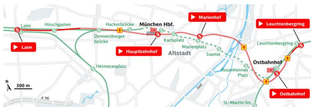
1. Planned route of the second main railway line in Munich

Due to the appropriate optimization of the network, the assumed daily flows of passengers at the level of PLN 250,000 significantly exceeded the assumed value and currently amount to over PLN 840,000 during the day [8]. Due to the fact that the capacity of the cross-city section was exceeded and the constantly growing passenger flows, it was decided to build a second cross-city route parallel to the already created line (the so-called Zweite Stammstrecke ). The approx. 10 km route will run between Laim in the west and Leuchtenbergring in the east. The key element for the investment will be a seven-kilometer long tunnel connecting the Main Railway Station with the Eastern Railway Station. The planned route of the new route against the background of the existing one is shown in Figure 1. The existing sections are marked in green and the newly designed route is in red. The sections in the tunnel are marked with a dashed line. Currently, the network is constantly expanded to ensure the best possible transport offer [7].