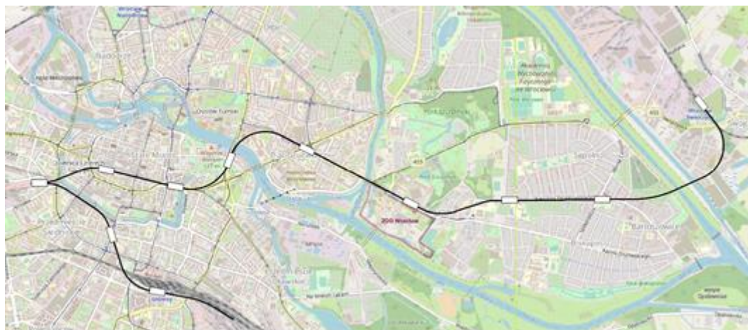
4. The proposed route of new cross-city routes