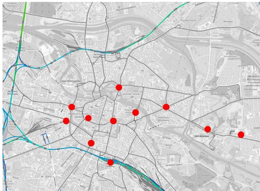
3. Distribution of traffic generators in relation to the Wrocław Railway Junction

The location of the above areas against the WWK background is shown in Figure 3. As can be seen in the figure, the generators are located mainly in Śródmieście, which means they are outside the direct influence of the railway network. Launching the LRT system, without building a new cross-city route, will significantly reduce its attractiveness because access to the destination will require a change.